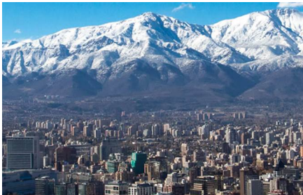
Santiago de Chile