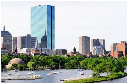
Nantucket - Ma