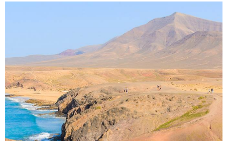
Costa de Papagayo