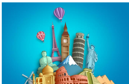
Parco Nazionale Arcipelago La Maddalena