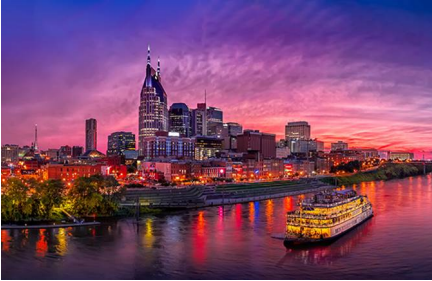
Nashville - Tennessee