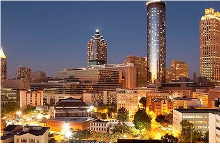
Atlanta - Ga