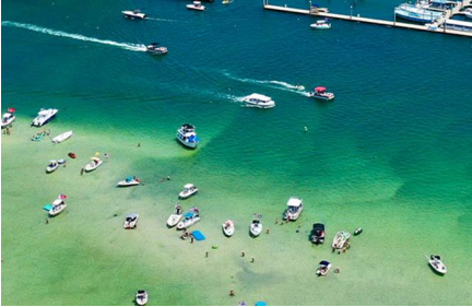
Orange Beach - Al