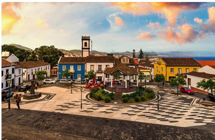
São Miguel Island