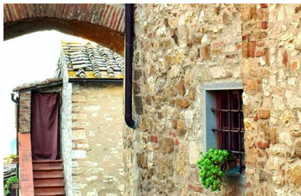
Greve In Chianti