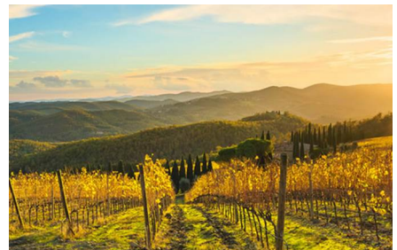
Radda in Chianti